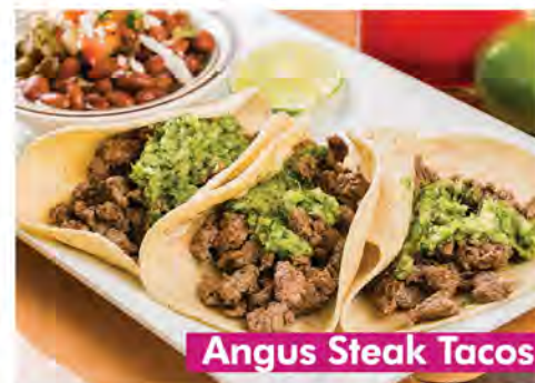
Angus Steak Tacos

Angus Steak Tacos NEW Three angus steak tacos topped with cilantro onion sauce, on a corn tortilla, served with Mexican rice and pinto beans. 12.99