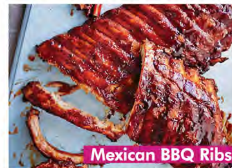
Mexican BBQ Ribs

Mexican Style BBQ Ribs FEATURED Choice of three flavourful sauces: Tequila Lime, Chipotle, & Mole (Sweet) Full Rack 19.99 Half Rack 15.99